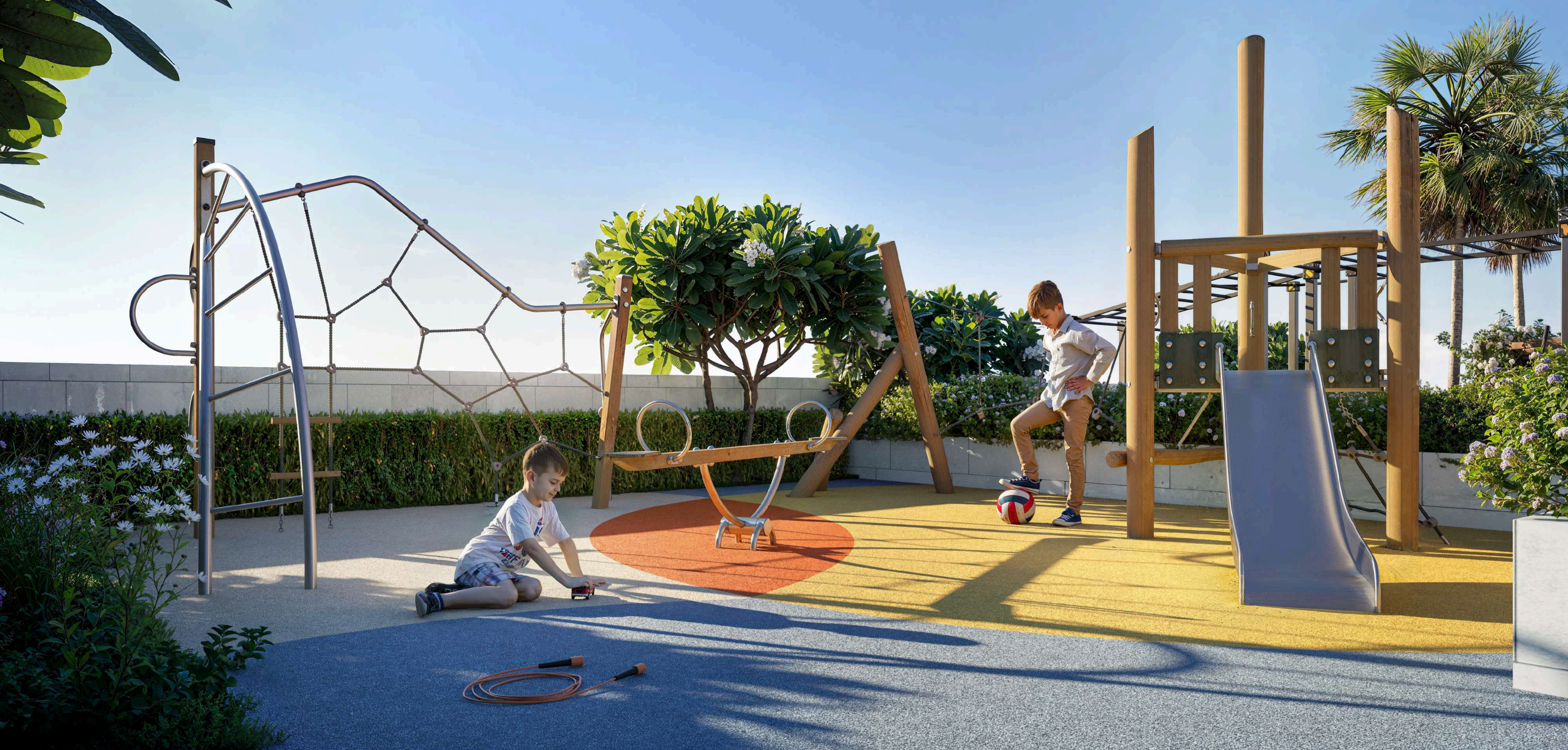
Outdoor Kids Area